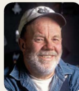
Gary Paulsen born 1939

For Gary Paulsen, the woods were often an escape from an unhappy home in a small Minnesota town. According to Paulsen, "all the hassles of life were very quickly forgotten" in the woods. His wilderness adventures and love of nature appear in much of his work.